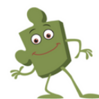
Dreams and Goals